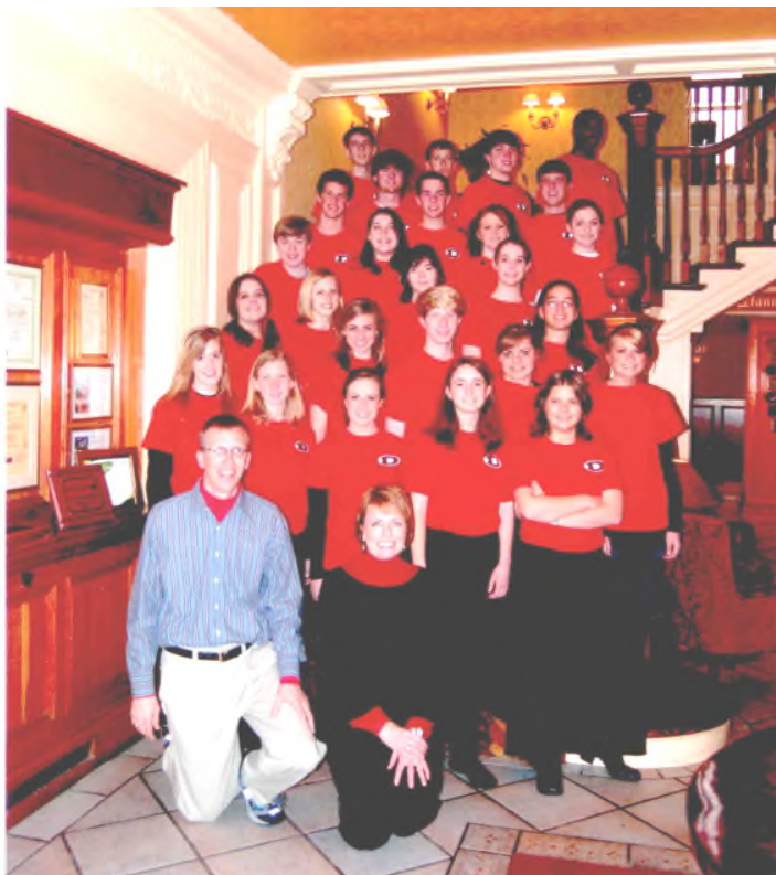
All Ireland Participants

Look for More Ireland Pictures in Next Month's Newsletter