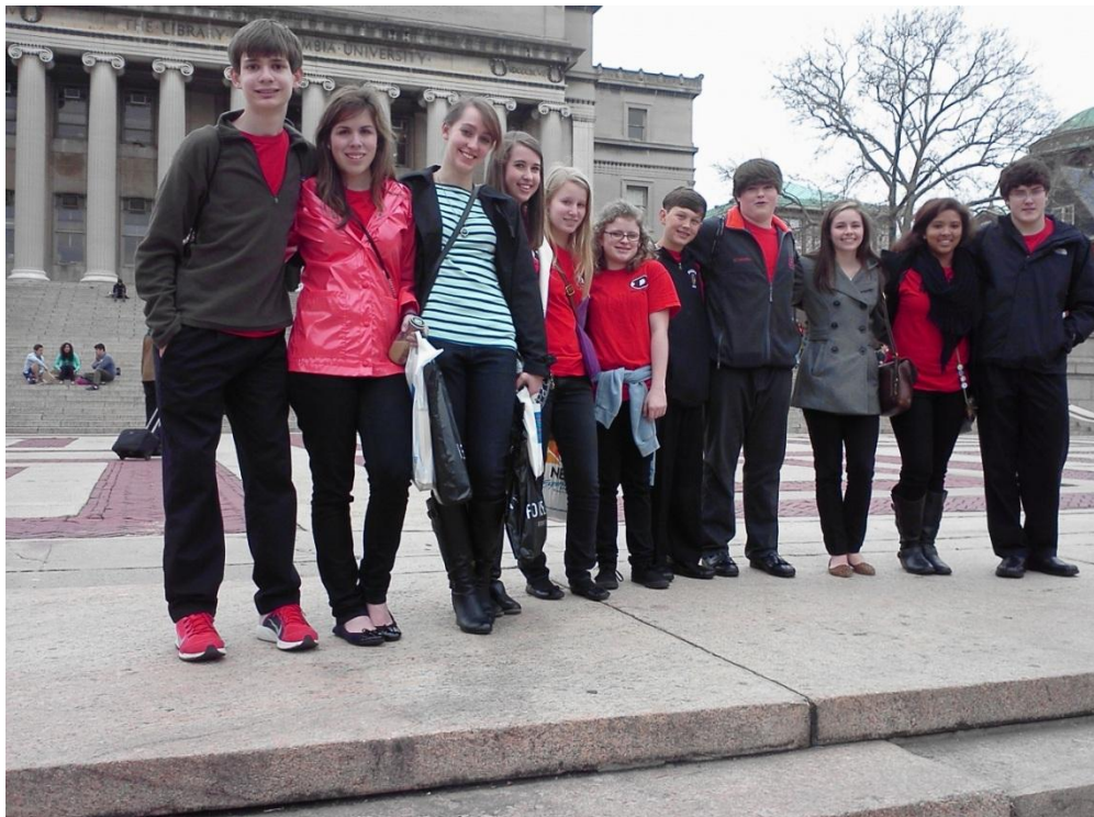
The Chorus Line